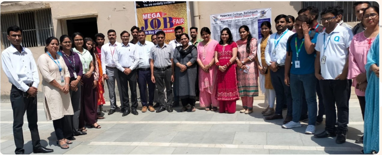
Students Registration at Aggarwal College, Ballabgarh