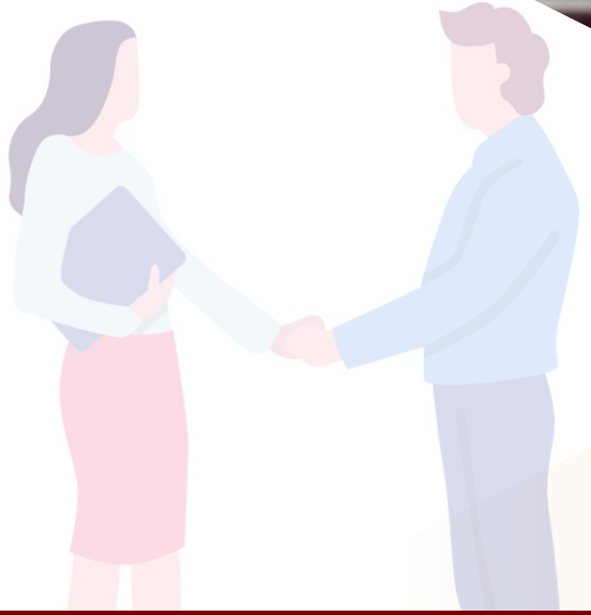
HR Participants at Aggarwal College, Ballabgarh