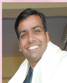
Bhupinder International Athlete