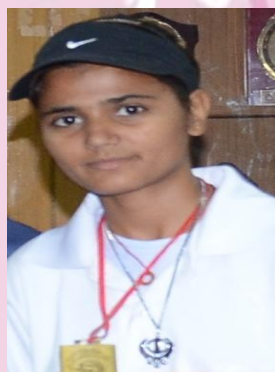
Pooja Hooda International Softball Player