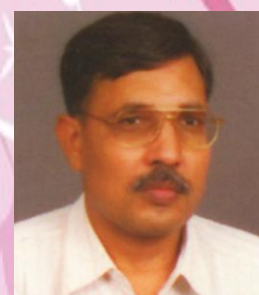
Sh. Mukesh Singhal Commissioner of Income Tax Chandigarh